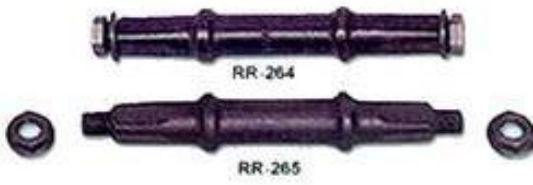
B B Axle