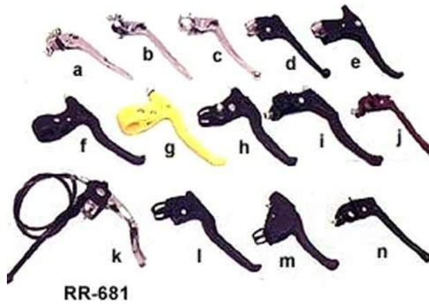
Bicycle Break Levers