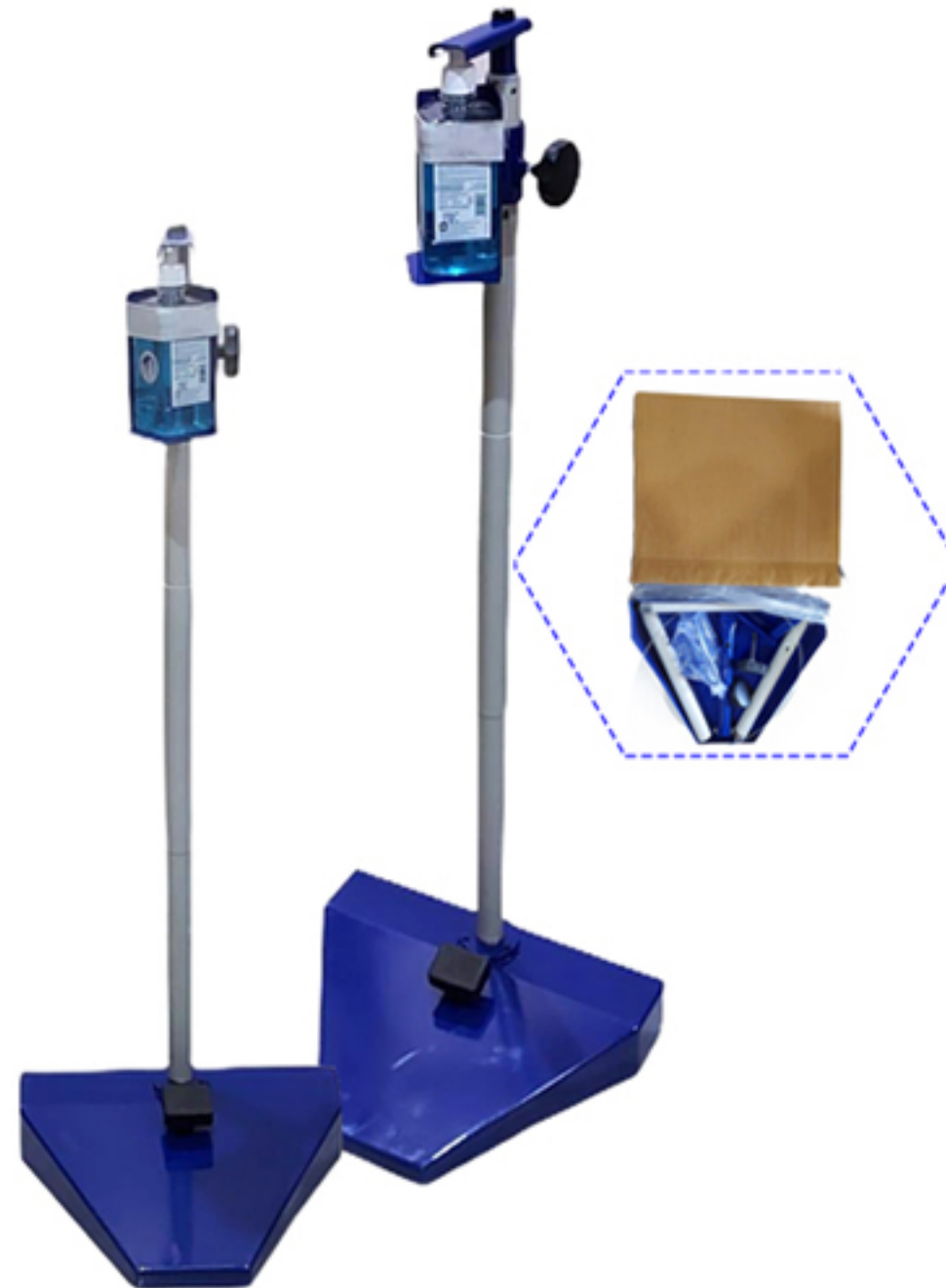
FOOT OPERATED HAND FREE SANITIZER DISPENSER