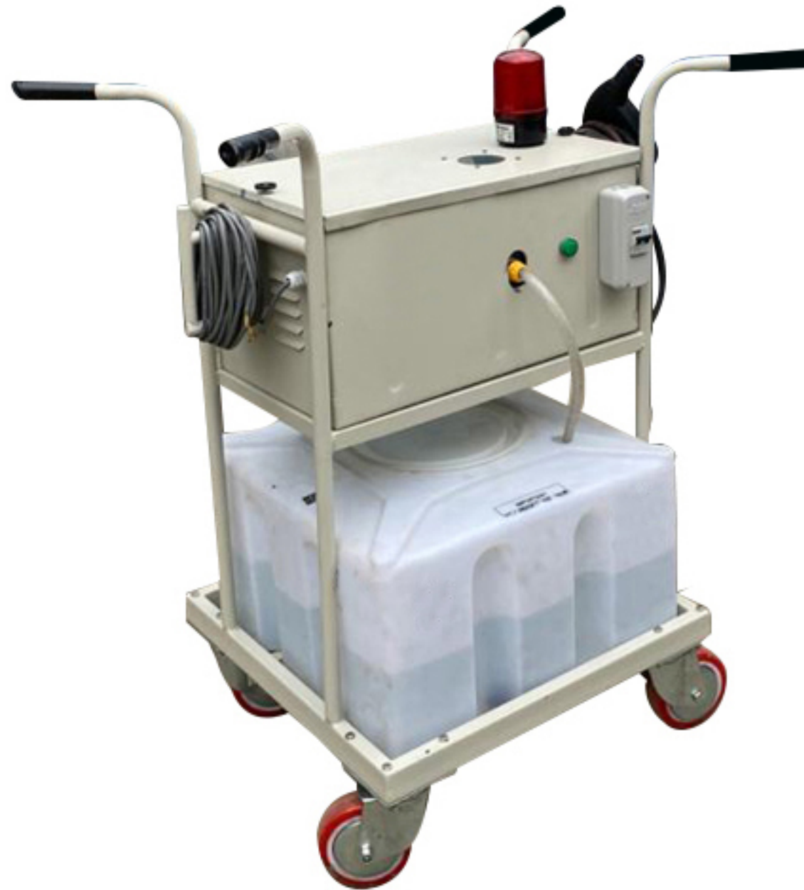
INDUSTRIAL SANITIZING MACHINE